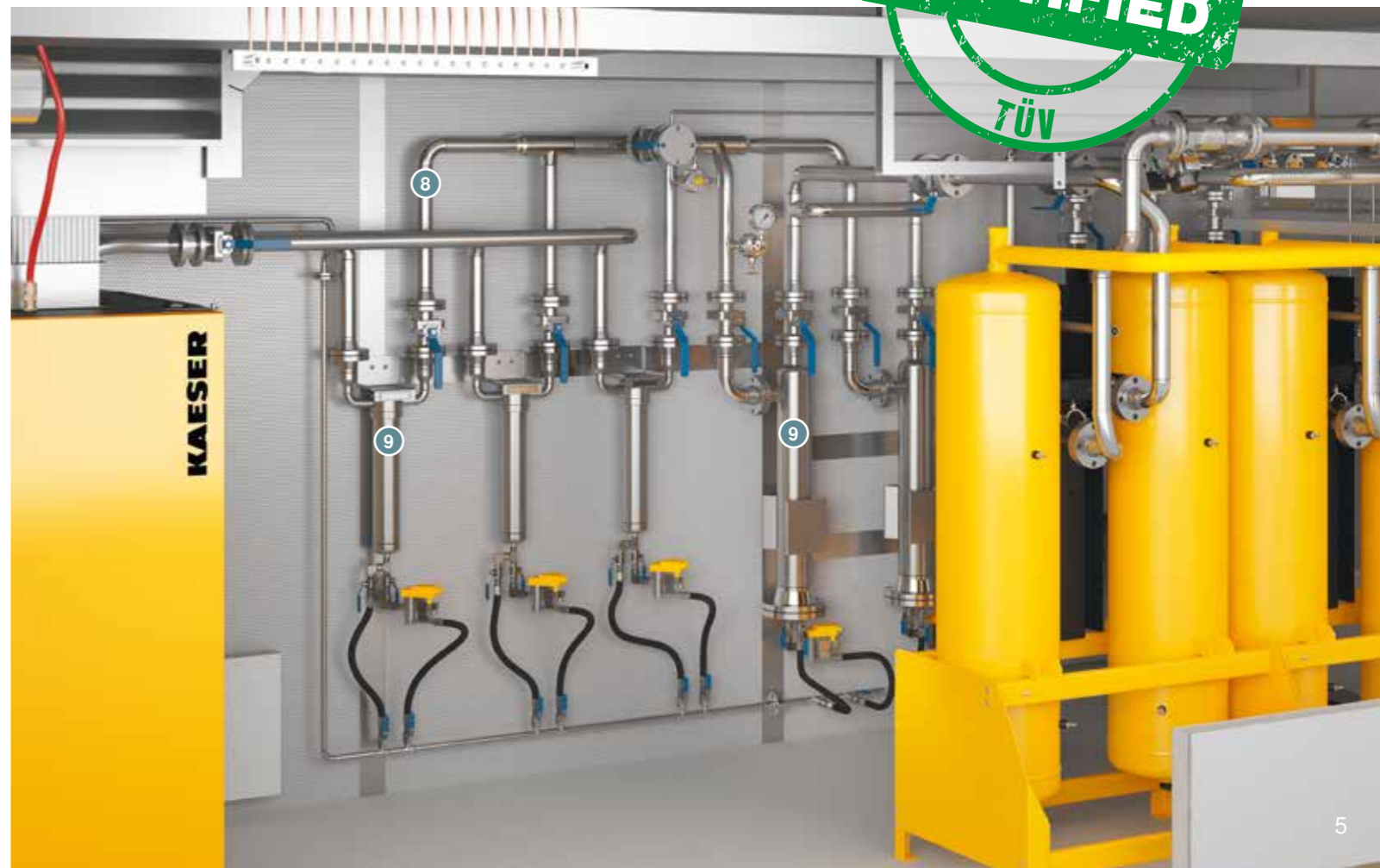
Container 3-D planning for filter and desiccant dryer pipework

If necessary for environmental or other reasons, the container floor can be designed as an oil-tight pan.