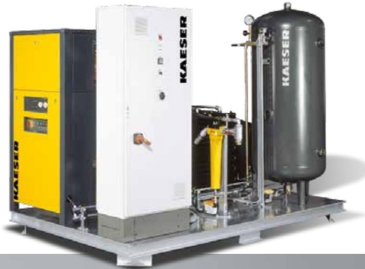
SIGMA PET AIR Packages

KAESER skid solutions are suitable for oil and gas applications with ambient temperatures of up to 60 °C, high sand load and for installation under a flying roof.