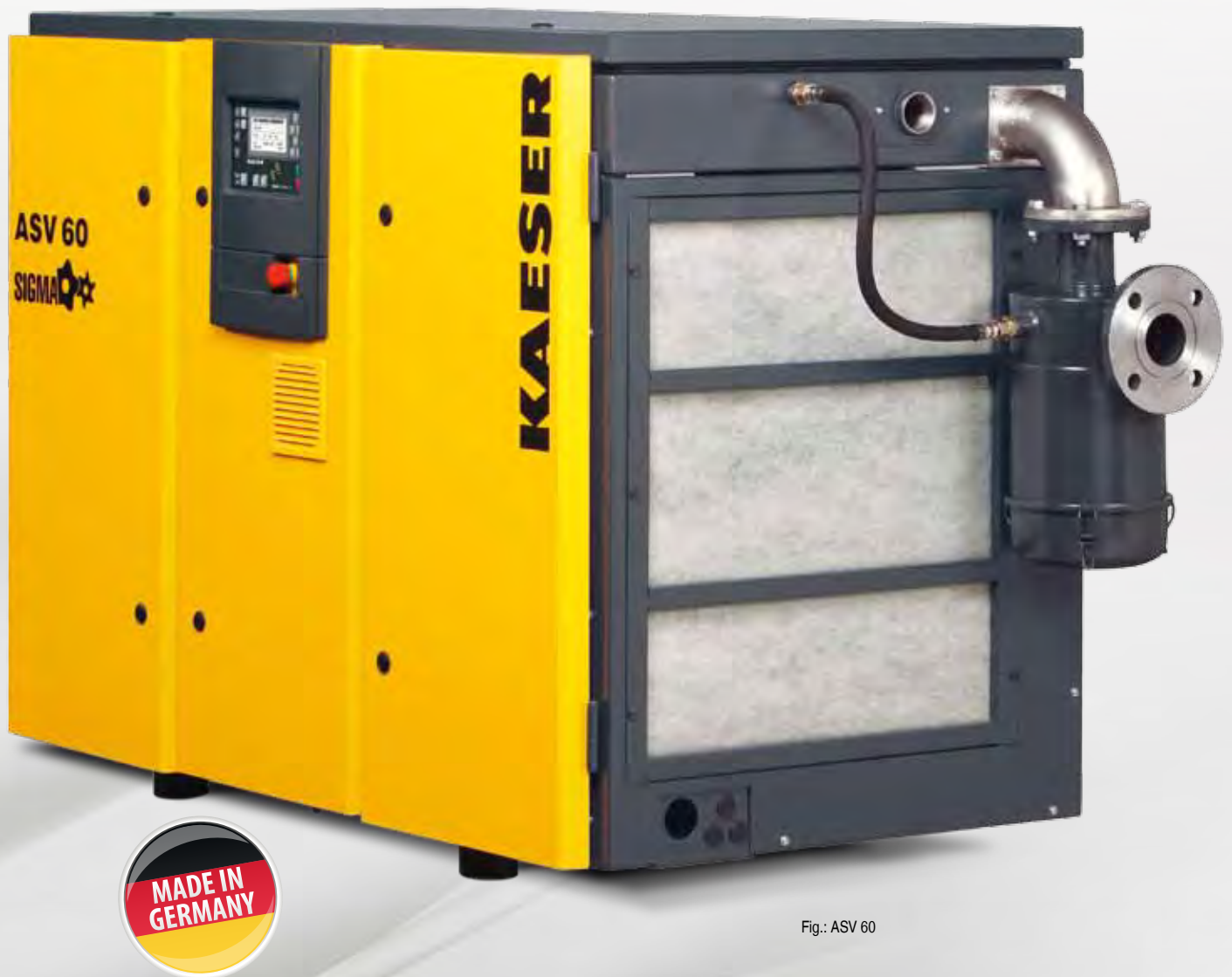
Fig.: ASV 60